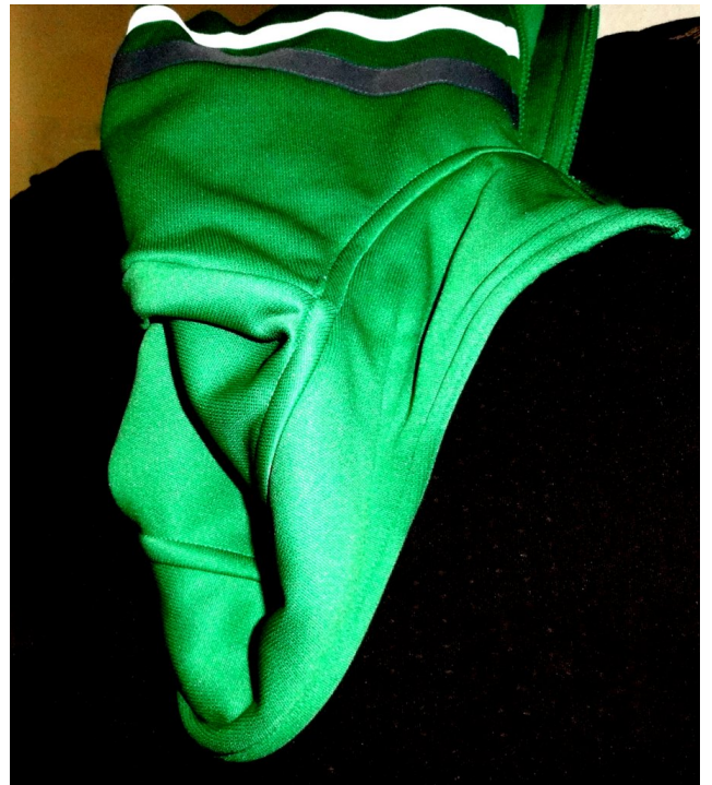
Color Digital by Peter Viot