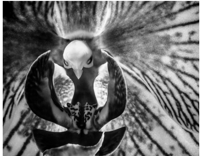
Monochrome Digital by Charles Gattis